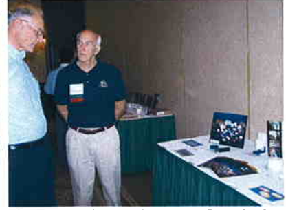
Vendor Night - Stellar Mfg. Display