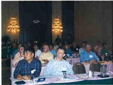
Technical Conference Attendees