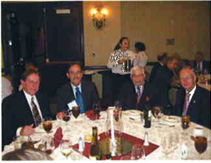
IBA Board Members