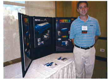
Rotex' Display at Vendor's Night