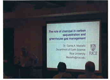
Neal Rice Award Winner